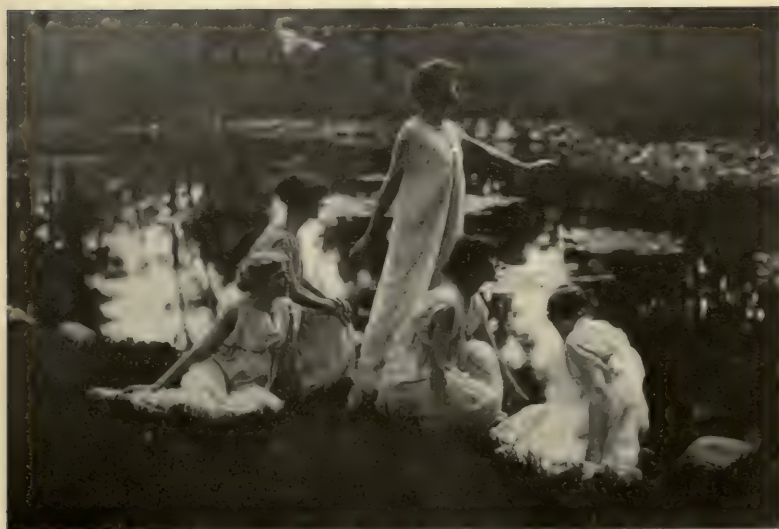
GROUPS IN MOVEMENT AND AT REST (Greek Games—Barnard)